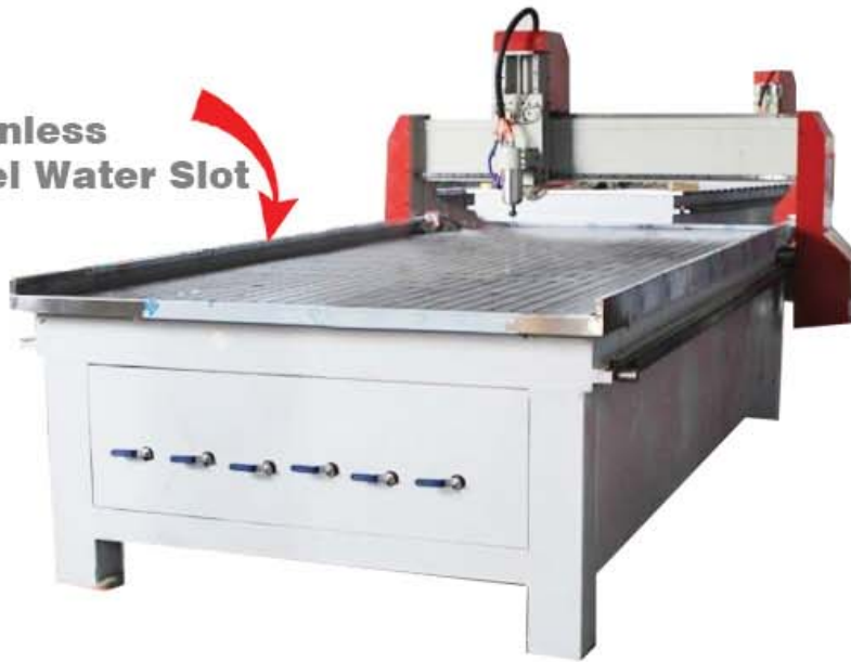
Stainless Steel Water Slot